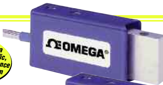
LCEB-10, $255, shown actual size.

See Section Y for a Selection of Scientific, Technical, and Reference Books Available from omega.com